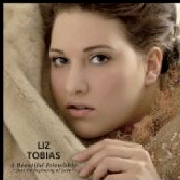
A BEAUTIFUL FRIENDSHIP (2007)