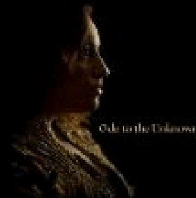
ODE TO THE UNKNOWN