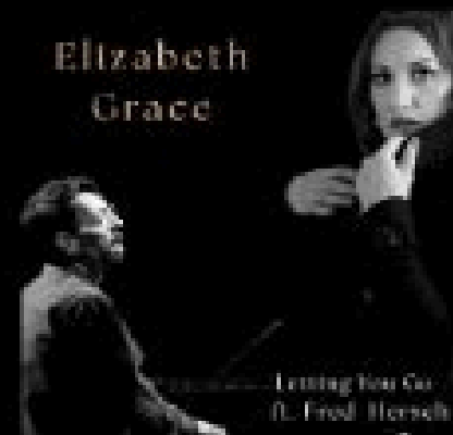
LETTING YOU GO