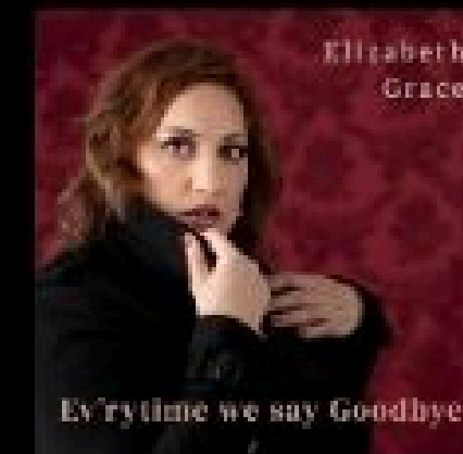
EV'RY TIME WE SAY GOODBYE