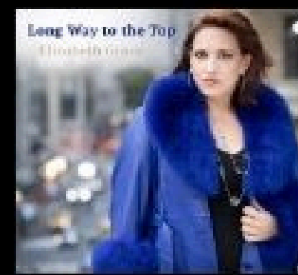
LONG WAY TO THE TOP