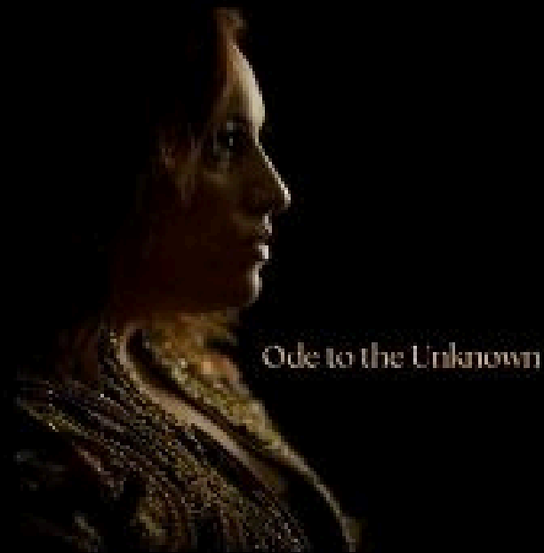
ODE TO THE UNKNOWN (2025)