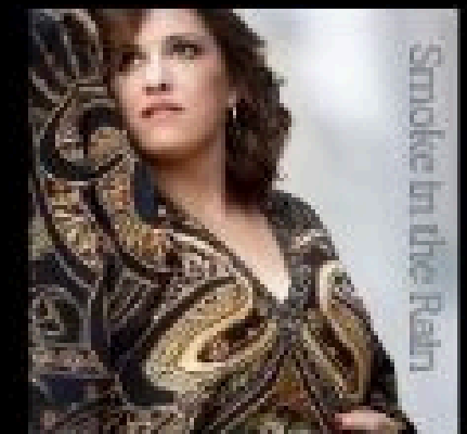
SMOKE IN THE RAIN